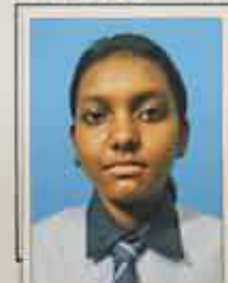
GOONJ MINZ - 83.25%