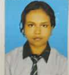
EMEN ASTI KISKU - 81.25%