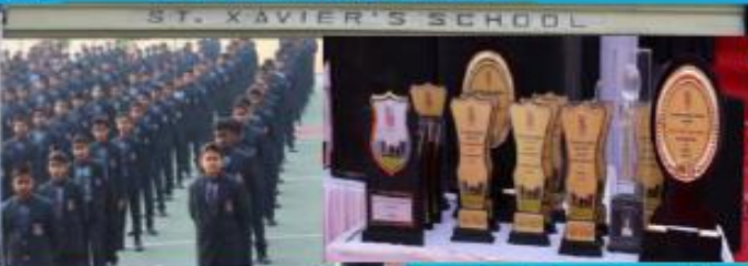
Cluster of Academic, Informative and Innovative Activities