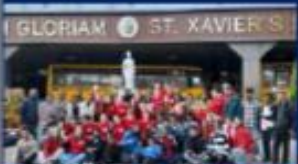
International Cultural Exchange Programs