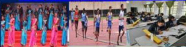
Blend of Cultural & Sports Activities