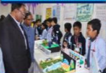
Project Based Education