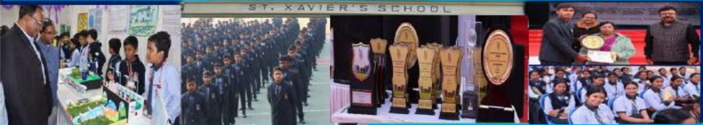
Project Based Education